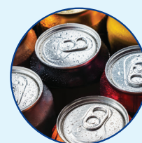
Fortified Beverages /Energy Drinks